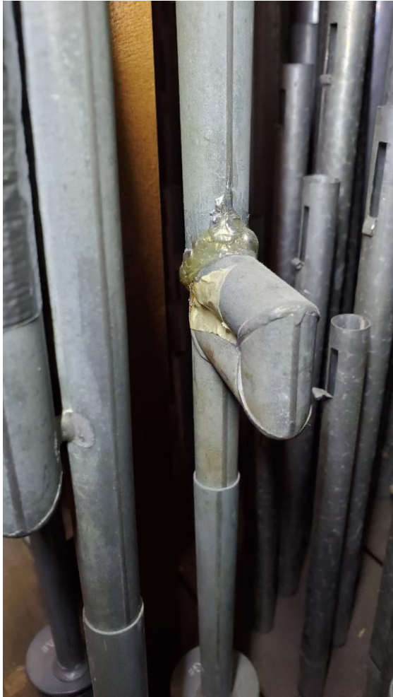
Glue used to hold pipes together.