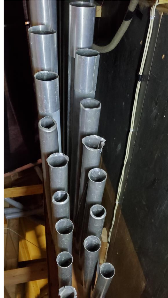
More damaged pipes. Notice misalignment.