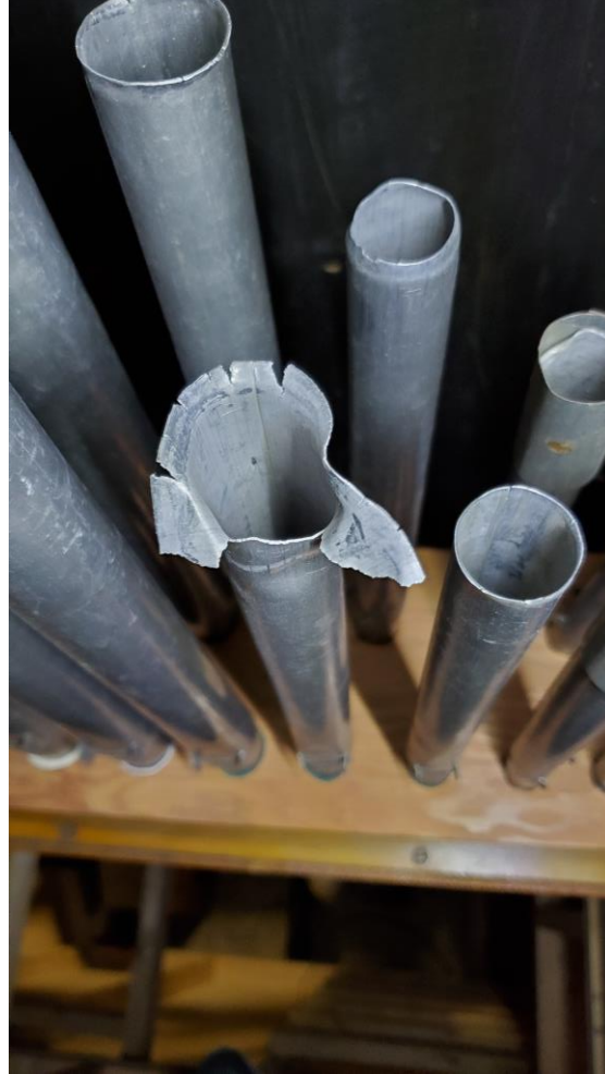
Pipes are severely damaged.